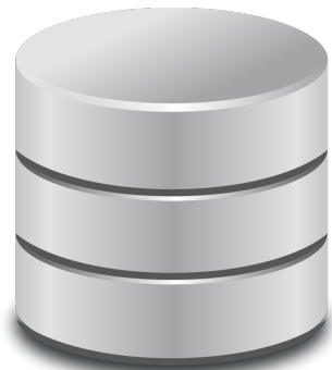
Figure: Database Scheme